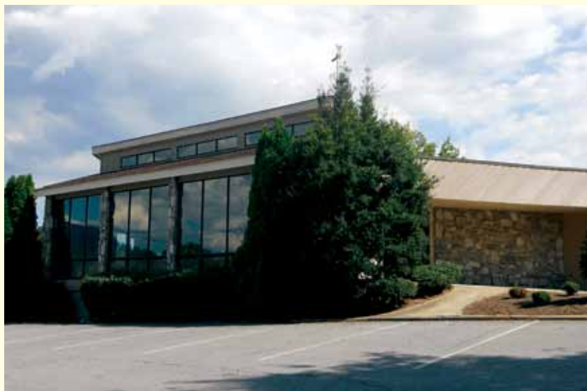
Mission Health System’s Outpatient Care Center, located in Clyde, is where CSNC physicians will begin seeing patients in early 2011.

For more information and to schedule appointments, contact Carolina Spine and Neurosurgery Center, (828) 255-7776 or visit www.csandnc.com .